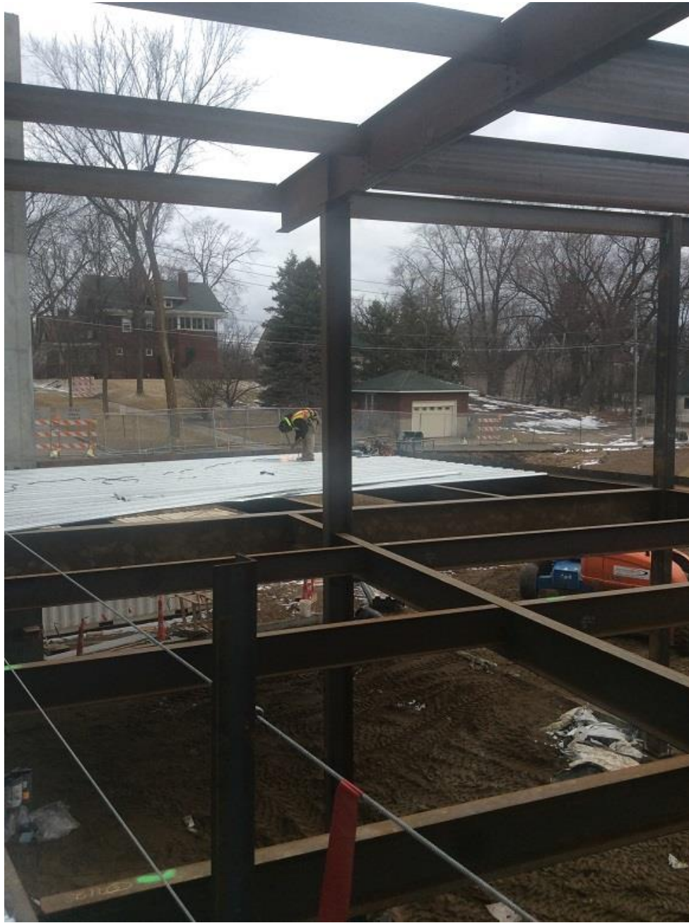
Steel erection seq 3