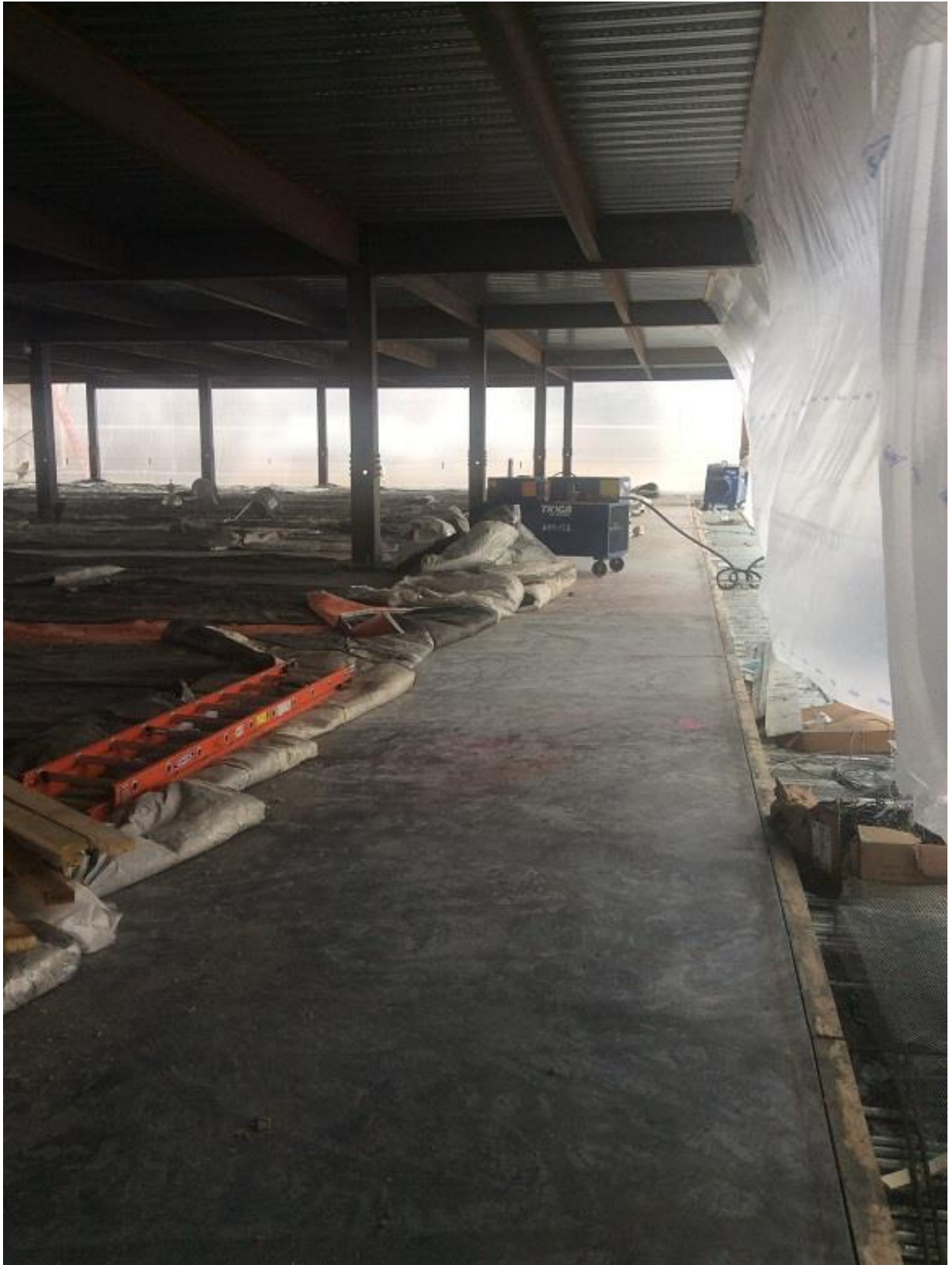
Deck poured 2 nd level seq 2