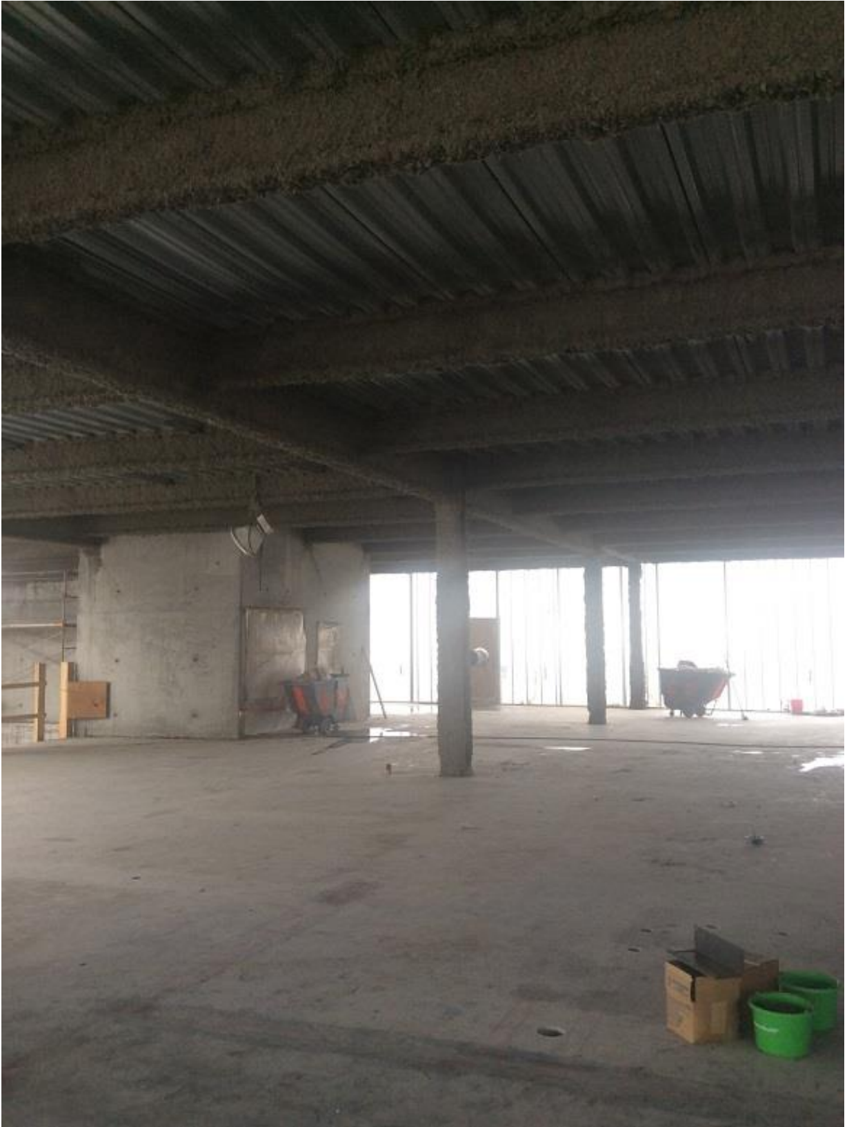
Fireproofing applied 2 nd level seq 1